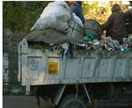
Picture 2. Garbage truck with overflowing garbage and unprotective sanitary workers

The hilly state also does not have regulations and mechanisms for managing septage, which results in groundwater quality contamination issues. Manual scavenging practices involved in informal septage management are curtailed significantly after adoption of the related Act. The percentage of urban households practicing open defecation in the state of Himachal Pradesh is 6.88%. Una district tops the list in Himachal with 22.79% households going for open defecation, followed by Kangra (14.71%) and Chamba (9.26%) districts.